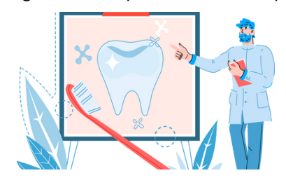
For more details visit our blog https://dentalclinicsmilecare.in/self-test_oral-care-tips/

Let's work together to keep our smiles healthy and bright!